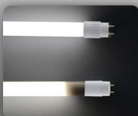
Other LED Tubes