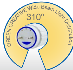
Lamp Front View

This lamp uses an innovative coated glass design that diffuses heat and light more evenly than plastic. As a result of its compact light engine, this lamp produces a light emitting area of 310°. This wider beam angle improves a fixture's total light distribution and creates a more complete lighting effect.