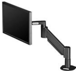
Monitor Arm SAA2415 Heavy Duty Arm

One of our toughest (yet attractive) LCD monitor arms! The SAA2415 floats big LCD monitors, LED displays, touch screens and even small flat