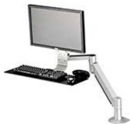
Mounts with Keyboard Trays

Monitor Arms, Monitor Stands and Monitor Poles with Keyboard Trays for LCD and LED screens