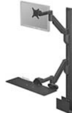
Wall Track Mount Heavy Duty Track COMBO 2

Our COMBO 2 Data Entry System is a true Sit Stand LCD and Keyboard Track Wall Mounted Solution that can be configured for ADA compliance. In its base configuration, the