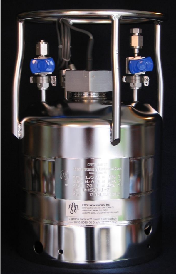
Conventional 2-valve config. OK for high V.P. precursors