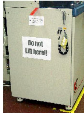
Figure 12: Removing the left side access door